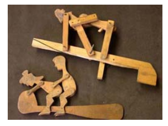
Handmade wooden sex toys from the Private Eyes: Amateur Art from the Kinsey Institute exhibition.

To date, these materials have received scant scholarly or sociological attention, and The Kinsey Institute is displaying the majority of these items for the first time.