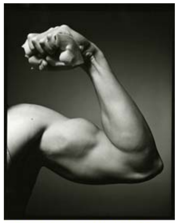
The Photographs of Len Prince October 21-December 21, 2011

New York photographer's collection at The Kinsey Institute.