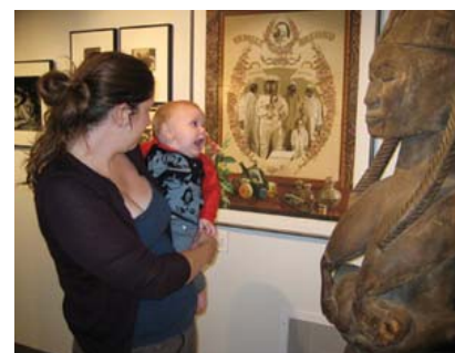
The wide variety of artifacts in the collection met with definite approval from this show visitor.