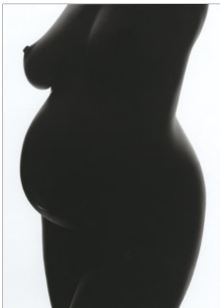
Left: Untitled, photograph, Les Sattinger. Right: Gravid Torso , photograph, Tom Stio.